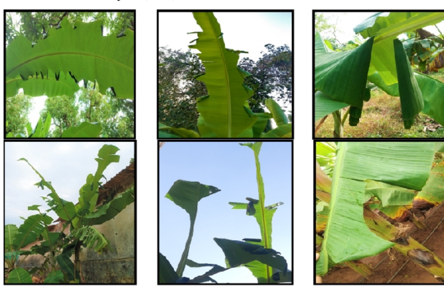
Plate 1. Damage caused by Erionota torus (Evans.).